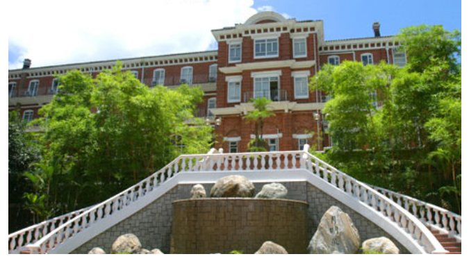
The University of Hong Kong

The Symposium will be held on The University of Hong Kong campus, China.