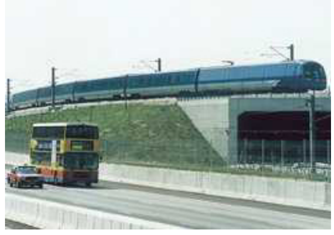
Having arrived at Hong Kong International Airport, take the dedicated, fast and reliable Airport Express train service to downtown Hong Kong. Trains run at 12minute intervals, the journey time between the Airport and downtown being about 24 minutes.